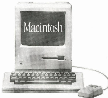
M2530 Macintosh 512K Enhanced