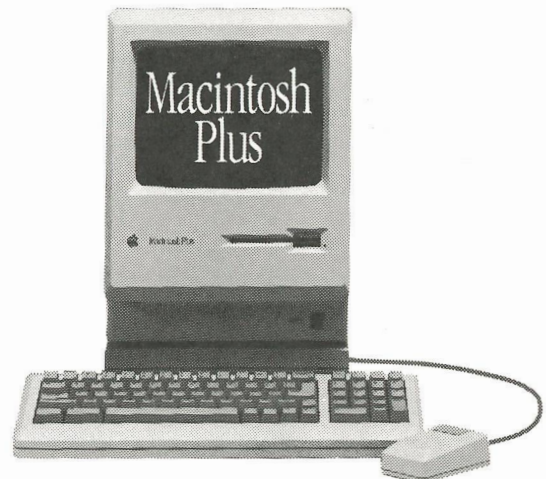
M2503 Macintosh Plus with M2605 Apple Hard Disk 20SC with SCSI card and cables