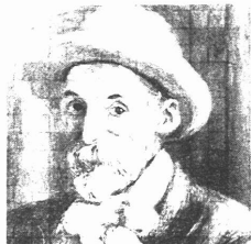
A portrait of Renoir, whose painting 'Les Duff' is the subject of an advertisement.

A FORMER WA family is scouring the world in search of what they claim to be a lost painting by French Impressionist, Renoir.