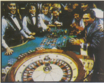
Digitized animation captures the sights and sounds of gaming excitement.

Welcome Macintosh users -- to TRUMP CASTLE II , the Ultimate Casino Gambling Simulation inspired by the fabulous Trump Castle Casino Resort By the Bay in Atlantic City. Now you can enjoy all the glamour, games and thrills of trying to capture a king's ransom--just as if you were actually inside Trump Castle! Multi-player capabilities, pull-down menus and actual digitized photos and sound straight from Atlantic City will make even a seasoned casino veteran feel right at home!