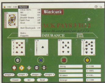
Pull-down menus make it easy for everyone to "Mac-gamble".

Hone your skill and try your luck with these six popular gambling games: